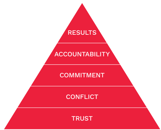
The Five Behaviors Model

The experience is completed through a half-day training session, led by a trained Five Behaviors expert. This session includes a walkthrough of the Personal Development profile, breakout activities, and group discussion.